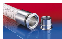
CONNECT PRESS ASSEMBLY 232