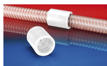
CONNECT 246 FOOD