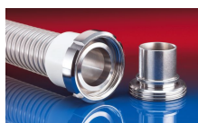
CONNECT MOULD ASSEMBLY 233