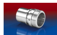
CONNECT THREAD FITTING 234