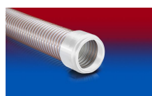
CONNECT 245 FOOD