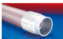
CONNECT 243 FOOD