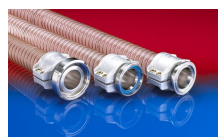
CONNECT SAFETY CLAMP ASSEMBLY 231