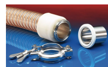
CONNECT TRI- CLAMP FITTING 245