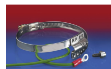
CLAMP 212 EC