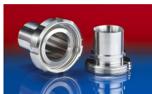
CONNECT DAIRY FITTING 247