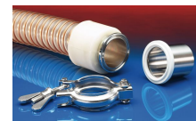
CONNECT TRI- CLAMP FITTING 245