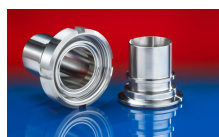
CONNECT ASEPTIC FITTING 249