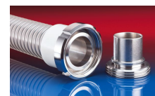
CONNECT MOULD ASSEMBLY 233